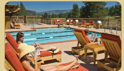
The Golf Club at Gray's Crossing Fitness Center

OWNERS MAY BECOME MEMBERS OF TAHOE MOUNTAIN CLUB. WITH ALL SEASON AMENITIES SURPASSING ANYTHING IN THE TAHOE REGION, THE CLUB PROVIDES ACCESS TO THE BEST OF LAKE TAHOE, INCLUDING: