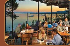
Wild Goose Restaurant