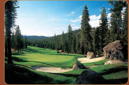
Coyote Moon Golf Course